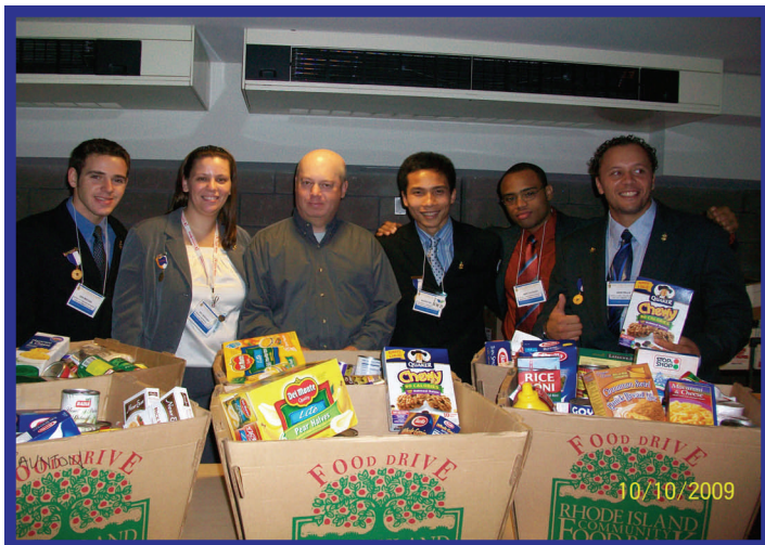
Pictured with the 09-10 New England Regional Officer team is Bruce from the Rhode Island Community Food Bank.